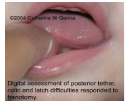
Types 3 and 4 may require a digital exam

Type 4 is most likely to cause difficulty with bolus handling and swallowing, resulting in more significant symptoms for mother and infant (see section on Diagnostic Assessment).